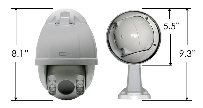
Big Power In A Small Package