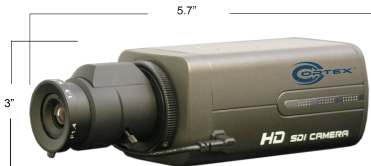
Shown with Lens Sold Separately