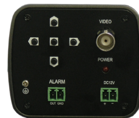
REAR PANEL AND CONTROLS