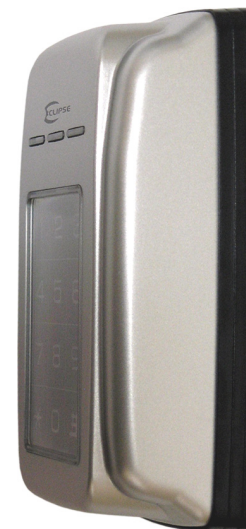
Side View 1.10 inches wide