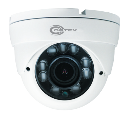
Perfect for powering an array of CCTV securtiy camera and other 12VDC devices

Use this power supply for CCTV cameras, heaters, and other video accessories. This 12VDC power supply has 4 PTC protected outputs and is designed for permanent installation. These regulated outputs are PTC protected with surge suppression. Power output fuses are rated @ 1amp for each channel. This unit will maintains your camera synchronization. It has a strong metal cabinet with knockouts, and can be secured with a barrel-style lock (included). If you're looking for a wall mounted power supply box for your security camera system, look no further.